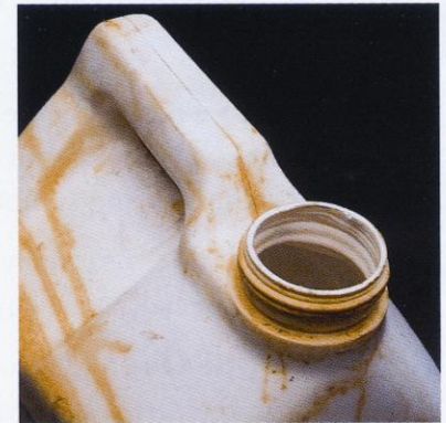
Dried formulation on thread.