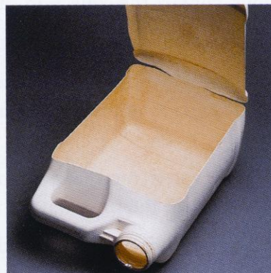
Inside stained but rinsed clean.