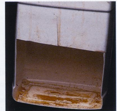
Bottom is caked with dried residue.