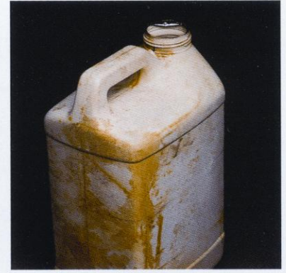
Dried formulation on container.