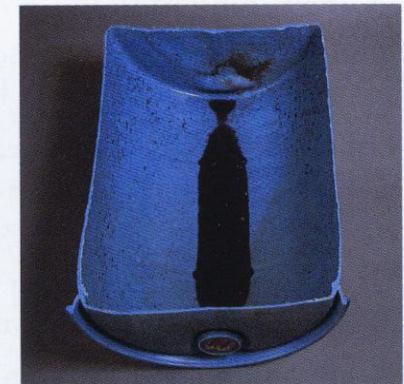
Liquid residue in container.