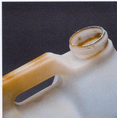
Handle and neck stained but clean.