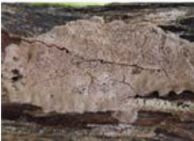
EGG MASS - OLD