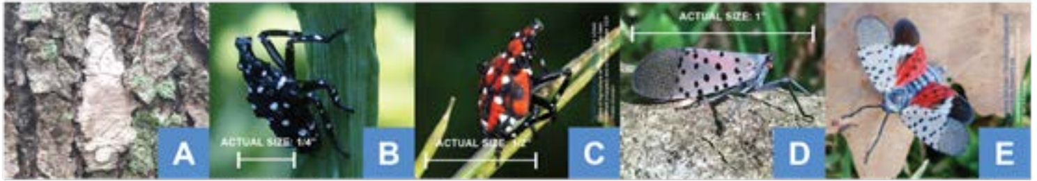
(A) Egg Mass: September to May