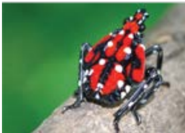
LATE STAGE NYMPH