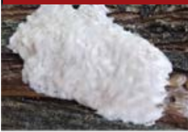
EGG MASS - FRESH