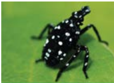
EARLY STAGE NYMPH