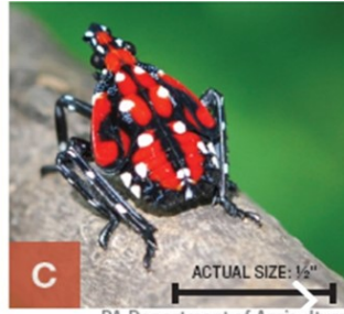
PA Department of Agriculture