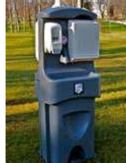
Sample for Type 2 or 3